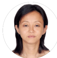
Brinda Dewan School Kitchen Gardens

SOS Carbon , a MIT spin-off, innovates ag-tech solutions at the oceans-seaweed-fertilizers nexus. Converting sargassum invasion into value chains , they disrupt chemical agriculture sustainably in the Caribbean and USA regions.