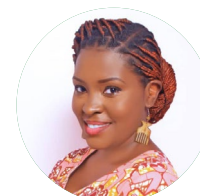
Immaculate Mbabazi Catholic Youth Network for Environmental Sustainability in Africa (CYNEA), Uganda