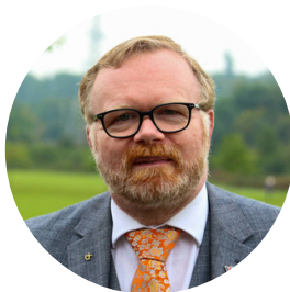
Hon. Martyn Day