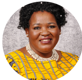
Hon. Melania Ndjago