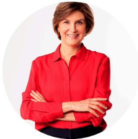
Hon. Julia Londono