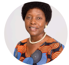
Hon. Roseby Gadama