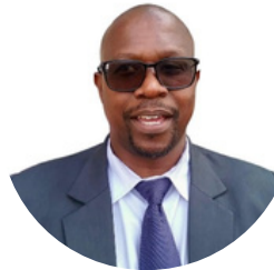
Hon. Lephoi Makara