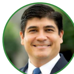
H.E. Carlos Alvarado Quesada 48th President of Costa Rica