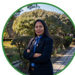
H.E. Sumana Shresta Member of Parliament Nepal/ Ex-Minister of Education Nepal/ GCAP 2023 Alumni