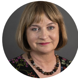
Hon. Julie Miville-Dechene