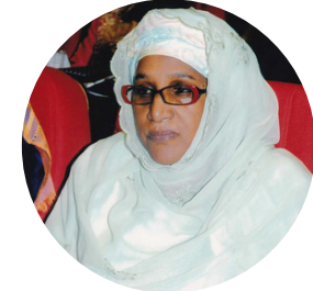
Hon. Habsa Kane Yahya