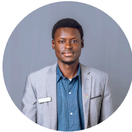
Hon. Abdoulie Njai