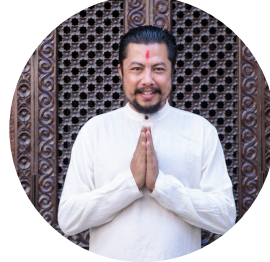
Hon. Biraj Bhakta Shrestha