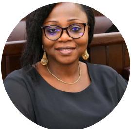
Hon. Edmonde Fonton