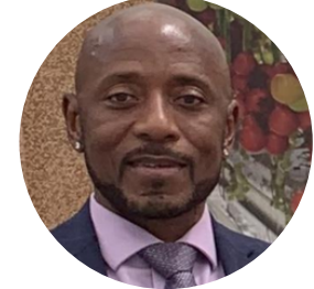
Hon. Dwight Bramble