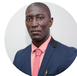
Hon. Ronny Clyde Aloema