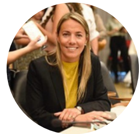
Hon. Ana Fabiola Aubone