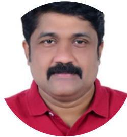
Hon. A.A. Rahim