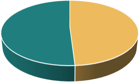
Female, 49% Male, 51%

The gender distribution of the participants was approximately 51% male and 49% female, reflecting a nearly equal representation of both genders.